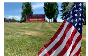
Veteran Establishes Empowerment Group