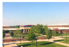
A Lasting Impact