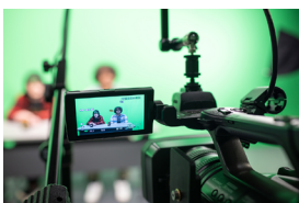
Visual Media Program Gets Students Industry Ready

Our newest edition of Aspire Magazine is now available. Read two stories about how veteran and active military students, faculty and alumni are serving their communities and country, discover one of LCCC's newest programs and learn about the impact a single conversation can have. ■