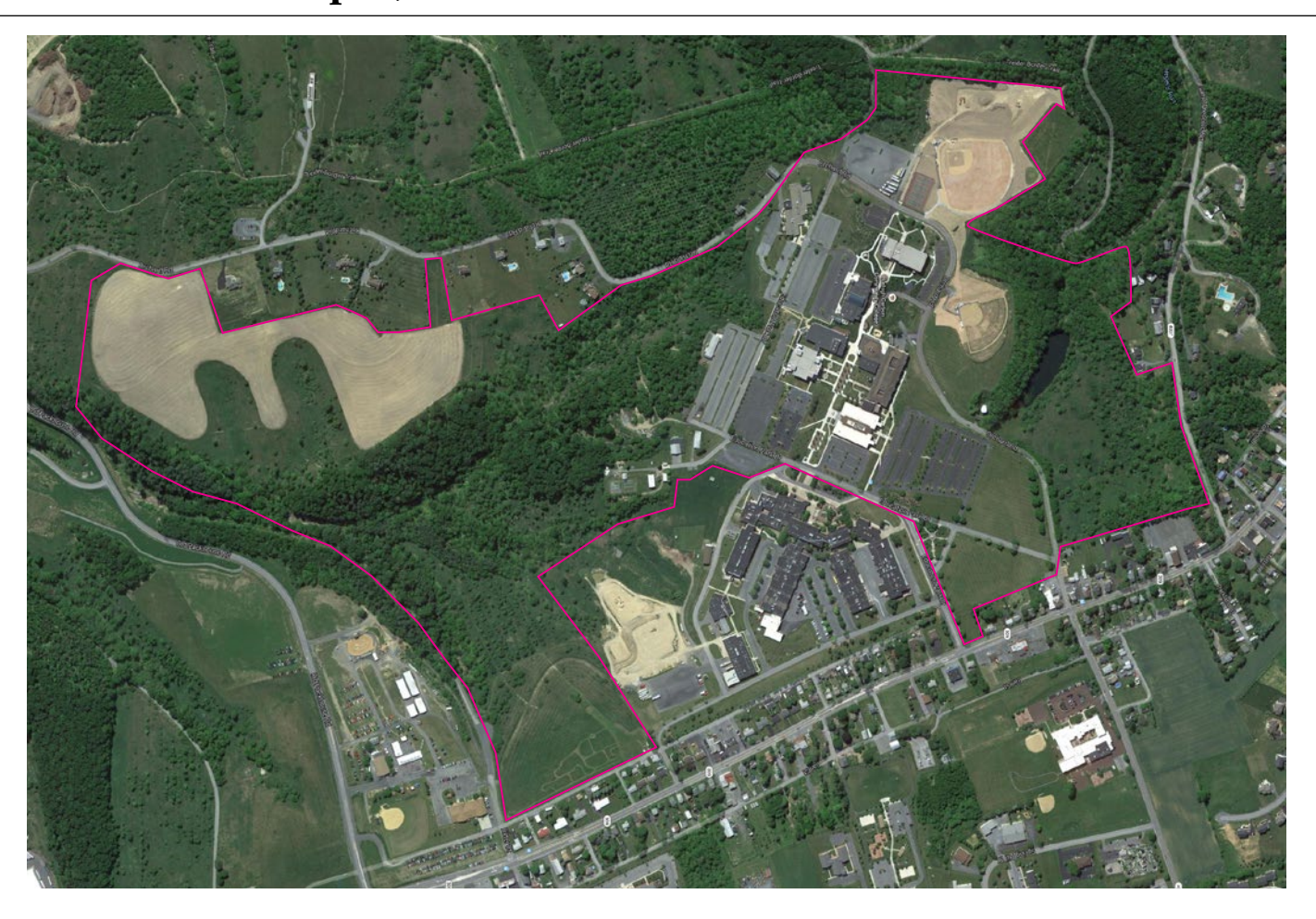
LCCC Allentown, Donley Center