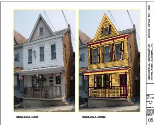
Blueprint Community program.

Image and Identity Goal: Seek opportunities to improve the image of the South Ward as perceived by the neighborhood and others.